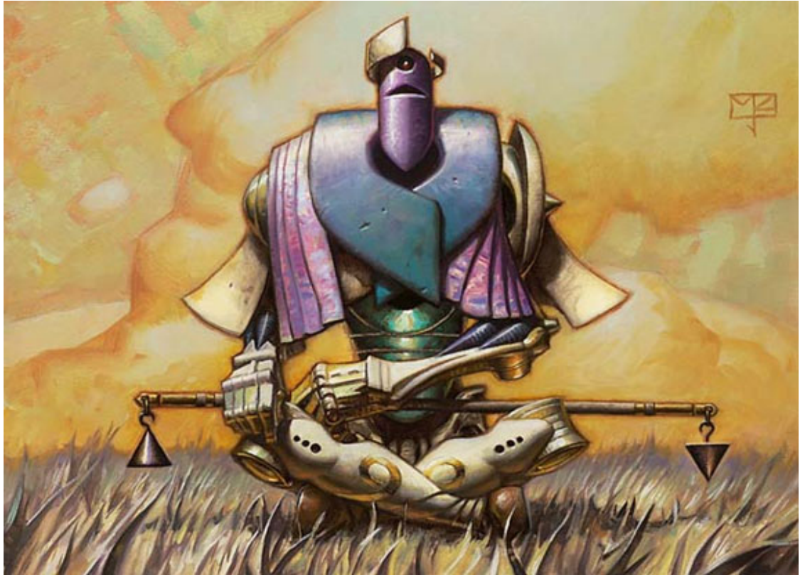
Silent Arbiter final art by Mark Zug

Now let's take a look at a blown-up image of the final art in its full glory. Here you can clearly see that the Arbiter is sitting in the Razor Fields (aligned with white, the color of balance and judgment, even though the Arbiter itself is an artifact).